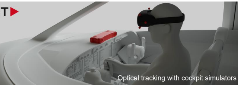
Optical tracking with cockpit simulators

Advanced Realtime Tracking GmbH & Co. KG Am Öferl 6, 82362 Weilheim i.OB www.ar-tracking.de shop.ar-tracking.de